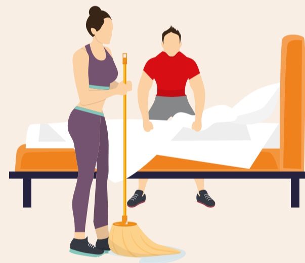
Housework 30 mins