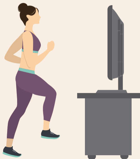
Jog on the spot 30 mins