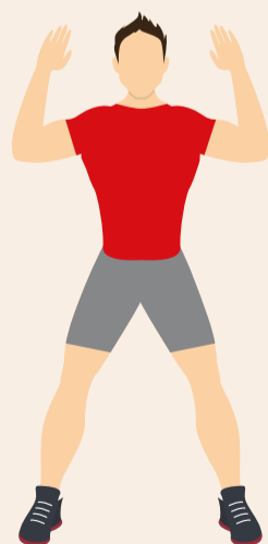
Jumping Jacks 15 mins