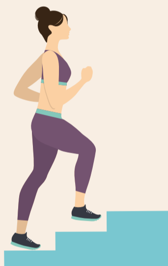
Climb stairs 15 mins